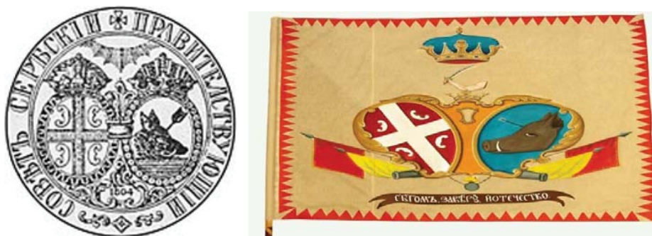
Coat of arms and flag with a wild boar as a symbol of ancient Serbs Triballs on the official coat of arms of the Seal of the Serbian Government and the flag of Serbian rebels against the reign of the Ottoman Empire 2

the custom of the noble men to hunt wild boars in Theba 3 , and so King Adrastus gave