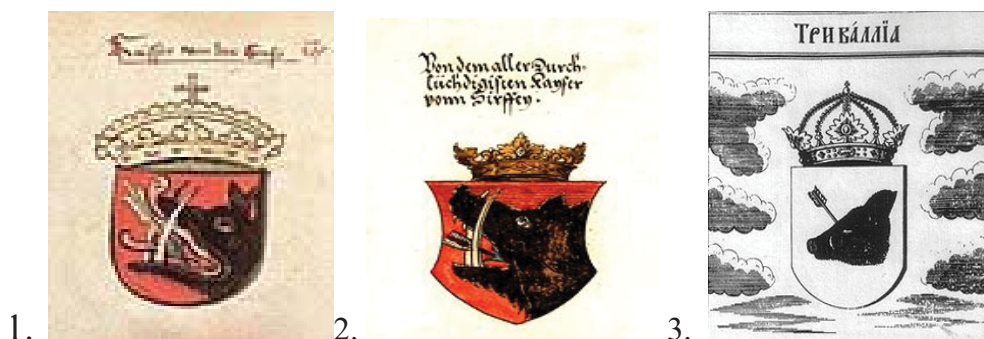
Medieval coats of arms of «The Serbian Kingdom of Triballs» 1