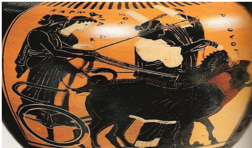
Apollo with the lyre drives Cadmus and Harmonia in the carriage pulled by a yoked domesticated lion and a wild boar

Black-figure antique vase, the 6th century BC, the author Diosphos Department of Greek and Roman antiquities, museum Louvre, Paris, France 1